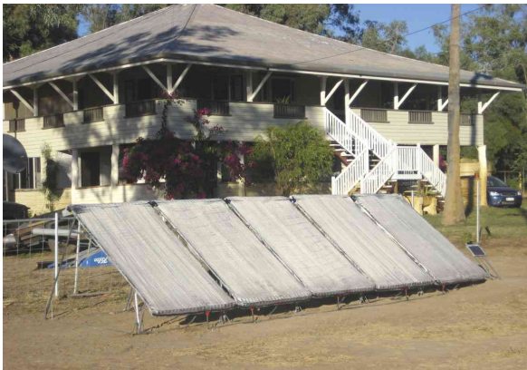
Solar Desalination/Distillation Panels